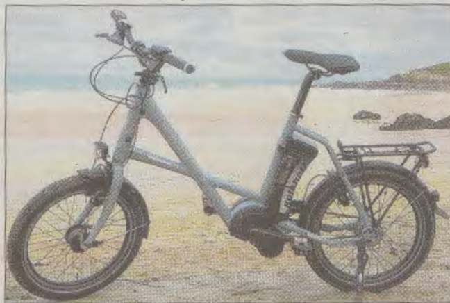
■ ON YER BIKE: One of a range of electric bicycles from Bike Higher.