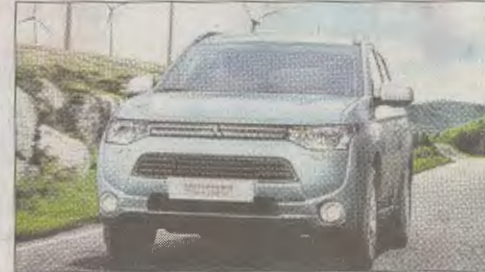
■ GET TURNED ON: Mitsubishi Outlander PHEV, a 4 x 4 plug-in hybrid SUV from Devonshire Motors.