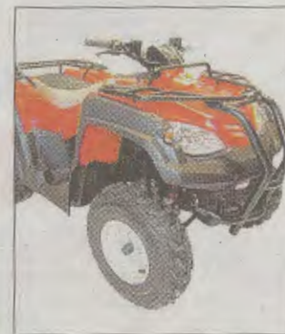
■ OUTWARD BOUND: Electric Quad bikes from Eco Charger.