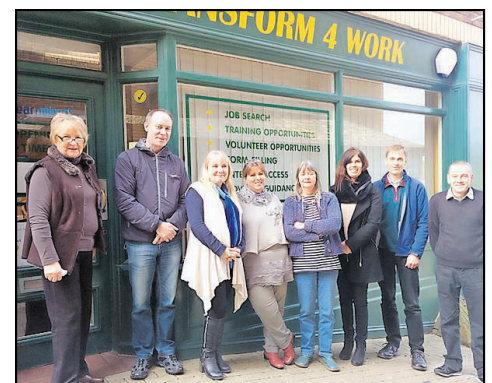
361 Empower outside Transform 4 work in Ilfracombe.

More information is available through Scribes CIC at Transform 4 Work or by e-mailing: info@361energy.org