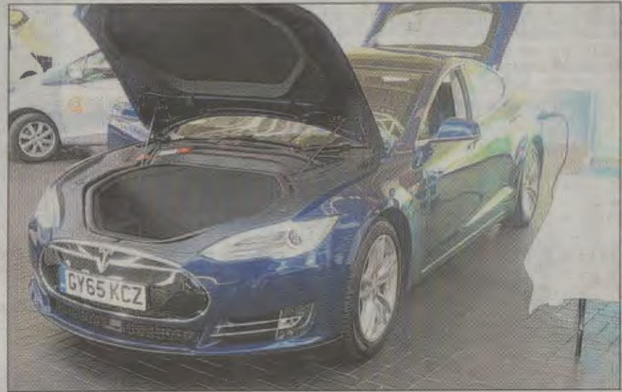
Clockwise from left: Exhibitors at previous Energy Fairs; BMW i8; Tesla Model S.